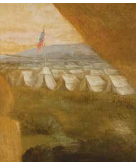
Rows of Union Army tents behind Morgan evoke his efforts as New York governor during the Civil War. Top, ultraviolet photography revealed the presence of a shellac coating discoloring the paint surface.